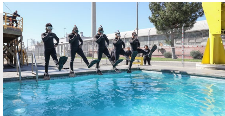
Below: CALPIA Marine Technology program participants in submersion training at the California Institution for Men