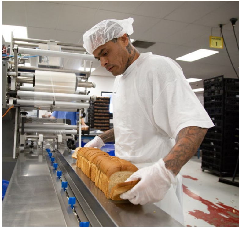
Above (left): CALPIA Construction Labor Program at the California Institution for Women Above (right): CALPIA Food and Beverage participant at California State Prison, Corcoran Below: CALPIA Code.7370 participants at San Quentin State Prison